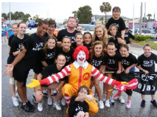
Acro Jax Team from Jacksonville, FL "Opening of the Beaches" Parade

I would like to thank you all for choosing me to receive the USTA Northern Illinois State Scholarship for 2010 for tumbling and trampoline, I am very honored that you believe I am deserving of this scholarship. I truly appreciate it. I will be heading to the University of Louisville Speed School of Engineering later this summer, and I plan to continue tumbling for as long as I can. I love the sports of trampoline and tumbling and I am grateful to the USTA for all I have been able to accomplish through my membership in it. I look forward to seeing all of you at Nationals in Springfield.